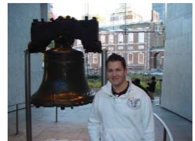
○ LIBERTY BELL IN PHILADELPHIA